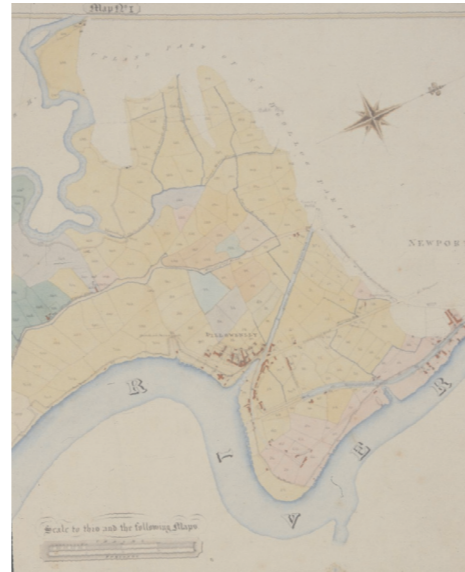
1831 Map of the Severn Levels

Since 1985, the study of this area has been co-ordinated by the Severn Estuary Levels Research Committee (SELRC). Its aim is to co-ordinate the research of all those, amateur and professional, who are interested in the history, archaeology, geology and palaeo-environments of one of the most remarkable estuaries in the world. It is probably the longest-established stakeholder and focus group of the type that the Severn Estuary Partnership is trying to establish to serve other interests. This newsletter contains a pamphlet produced by the committee, which tries to summarise the results of research by many of its members and sets out some of the key issues concerning the future of this precious landscape.