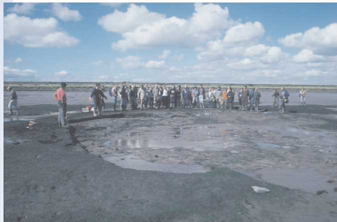
SELRC visit to Goldcliff, Newport

So don't let this be the case on the Severn. Have your stake noticed by getting involved with the SEP COASTATLANTIC project.