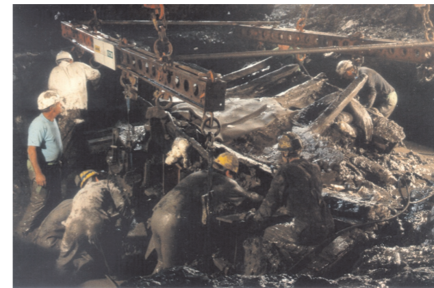
Excavation of Magor Pill Boat

More challenging was the lifting of the remains of the Magor Pill wreck from the foreshore intact, in 1995. This clinker-built vessel, dating to 1240, foundered with the remains of its last cargo, iron ore and ochre from the Forest of Dean.