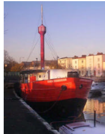
Severn Wonders Working Group meetings took place on the John Sebastian Lightship, Bathurst Basin in Bristol

Minutes of the Severn Wonders Working Group meetings are available as Appendix B.