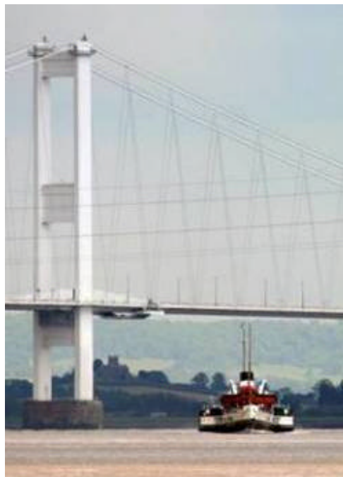
The Waverley was chartered to launch the 1 st Severn Estuary Forum during the Severn Wonders Festival, June 2006