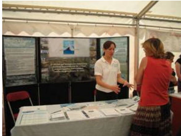
Bristol Festival of Nature